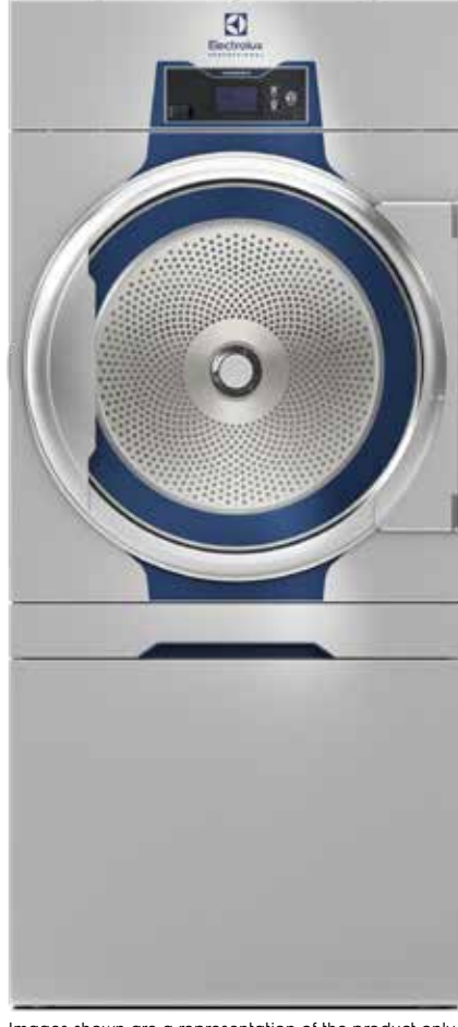
Images shown are a representation of the product only and variations may occur.

To get the door design you need to add the insulated alass.